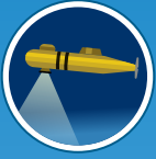
UAV & UUV