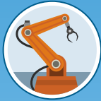
Calibration of Robots